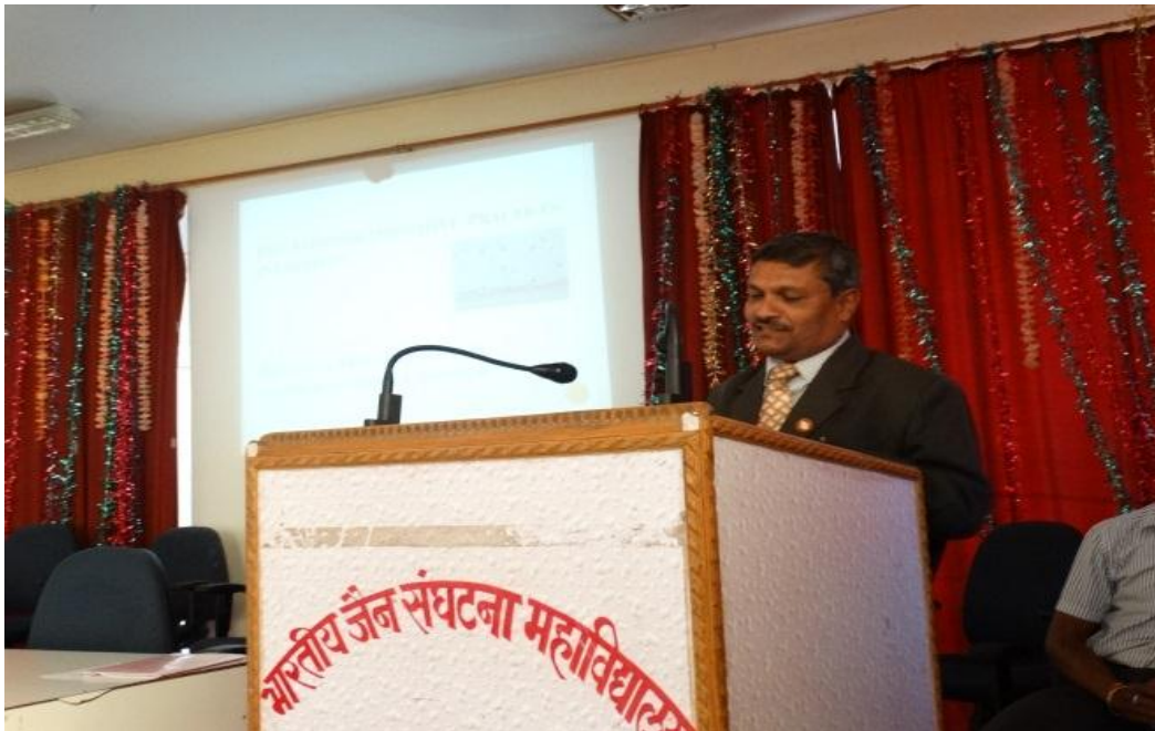
Department of Physics Organized a Guest Lectures.