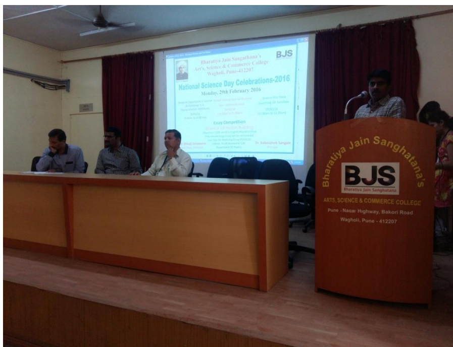
Inaugural function of National Science Day Celebration by Department of Physics on 29 th February 2016.