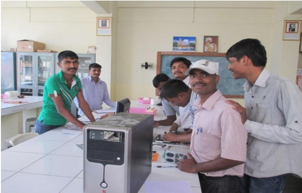
Department of Physics Organized a workshop on Computer Hardware and Maintenance.