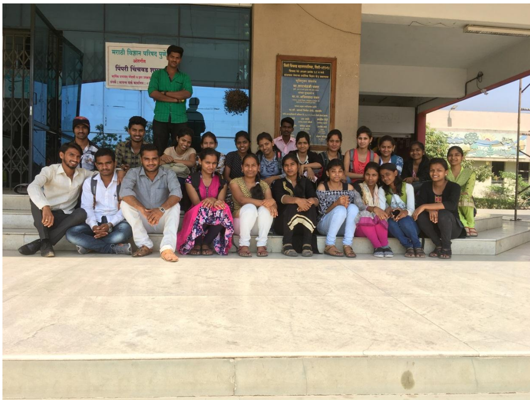
Study Tour to Science Park, Pimpri Chinchwad, Pune.