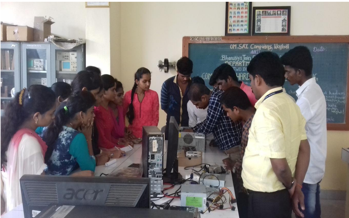
Students got hand on training in workshop